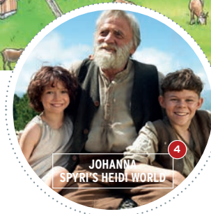
JOHANNA SPYRI'S HEIDI WORLD 4