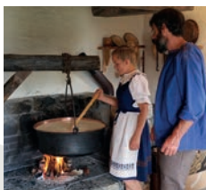
CHEESE-MAKING WITH GRANDFATHER