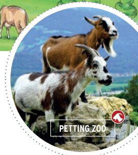
PETTING ZOO 🐾