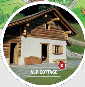
ALP COTTAGE 2