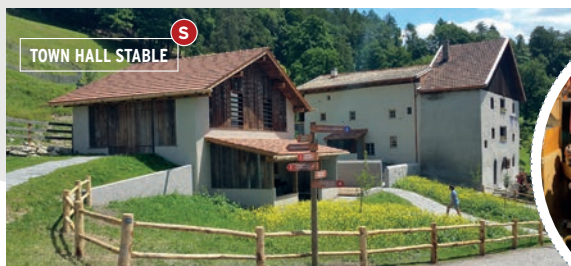
TOWN HALL STABLE S