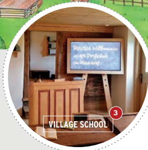
VILLAGE SCHOOL 3