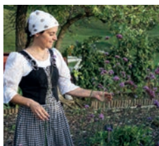
HEIDI'S HERB HUNT