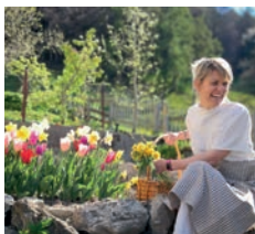
HEIDIDORF GUIDED TOUR

Discover Heidi's home in the mountains during an informative guided tour. Experience a school lesson as it was in Heidi's day, or carve your own spoon with grandfather. Learn about local medicinal herbs on a herb hunt and make your own ointment ... There is so much to see, learn and discover in the village. Bookable in advance.