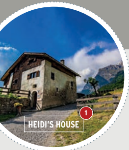
HEIDI'S HOUSE 1