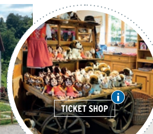
TICKET SHOP i