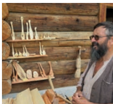
WOODCARVING WITH GRANDFATHER